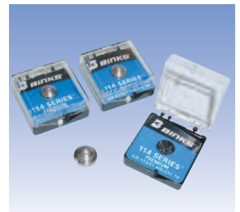
Premium, fine finish and twist tip range available