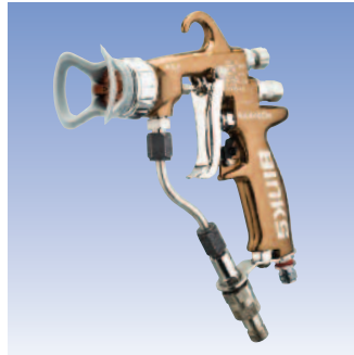
A4400M spray gun. Part no: 0909-4400-10000E