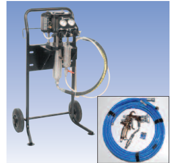
MX 12/31 12 litre per minute high volume pump