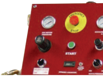
Easy to use control console