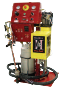
Some photos courtesy of RTM North.