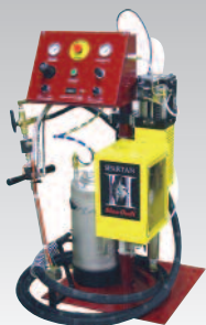
STANDARD SPARTAN II