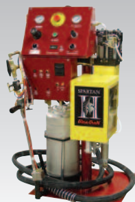
SPARTAN II DELUXE