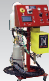
SPARTAN II PAC