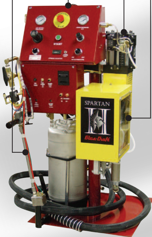
SPARTAN II DELUXE

GlasCraft, Inc., the industry authority in manual and automatic dispensing equipment has developed the Spartan II proportioner which is precision engineered for low pressure injection of polyester and vinylester resin systems. Its revolutionary design allows the user to custom configure the system to meet the specifics of the job while easily being upgraded in the field. GlasCraft has again led the closed mold FRP industry to new levels of performance.