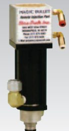
MAGIC BULLET AUTO-VALVE