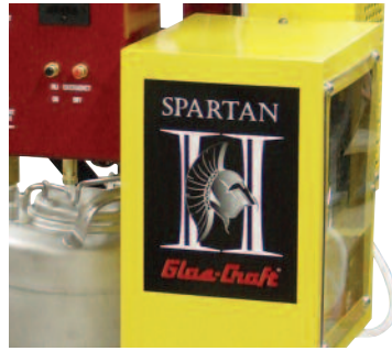
Positive feed catalyst pump