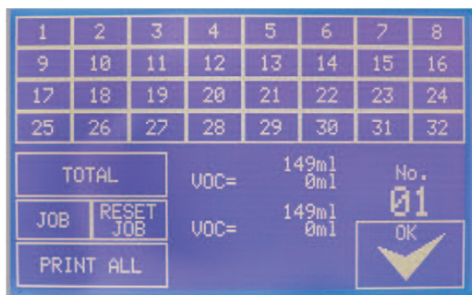
Consumption of up to 32 colours/materials (resin, catalyst and solvent) can be independently monitored for VOC content and material usage.

For more technical information refer to the Binks Magic Flow Service Bulletin.