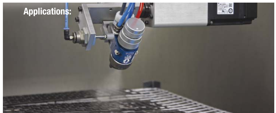
Graco's AirPro EFX™ Automatic Spray Gun automated air-operated application.