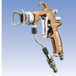
A4400M spray gun. Part no: 0909-4400-10000E