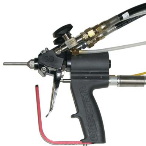
Probler P2 with Delayed Air Purge & Dispense Counter Option