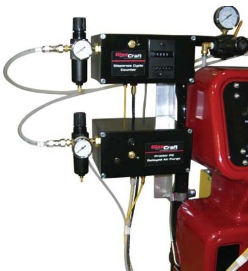
Guardian A Series system with Delayed Air Purge and Dispense Counter