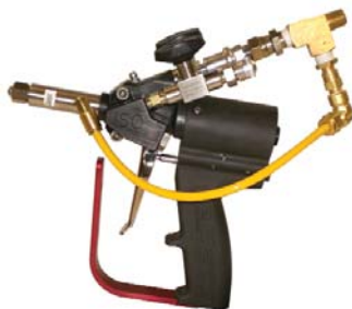
Probler P2 with Air Nucleation Kit

The Air Nucleation kit allows for air to be introduced with the mixing chemicals. The static mixer and air nucleation combine to provide additional mixing for pour and spray applications. The air nucleation atomizes the mix and helps create a usable spray pattern.