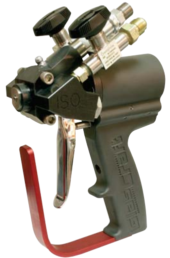
Standard Probler P2 (23950-XX) Probler P2 Elite (23940-XX)

Whether you are applying insulation foam, spraying bed liners, or spraying polyurea, the Probler P2 is the most reliable and consistent spray gun available today.