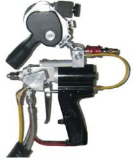
Probler P2 with B-410 chopper attachment

There are many new applications for adding chop fibers to foam or coatings. These fibers can act as filler or be structural depending on the length and percent of the fibers. These new applications include FRP replacement projects for open mold production.