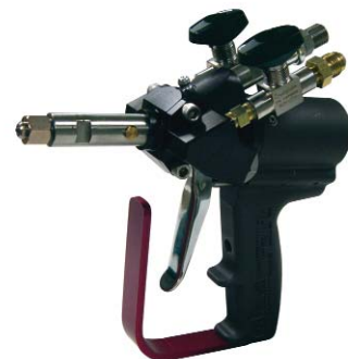
Probler P2 with Static Mixer

Many applications require additional mixing of the A and B materials in order to achieve optimal performance. This static mixer attachment can be used for spray, pour and injection dispensing.