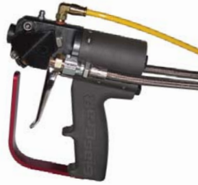
Probler P2 Elite with horizontal hose configuration

The Probler P2 Elite allows easy access to both the Iso & Poly filters without removing the sideblocks.