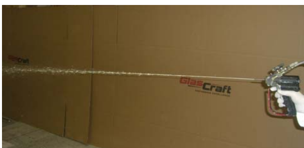
Stream Jet Application Up to 30' (10m) stream