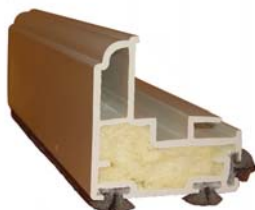
Foam filled window frame & chilled storage frame using the Probler P2 with Stream Jet Nozzle and Delayed Air Purge / Dispense Counter