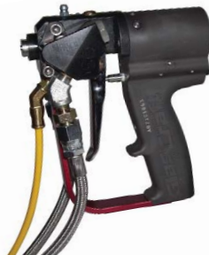
Probler P2 Elite with vertical hose configuration