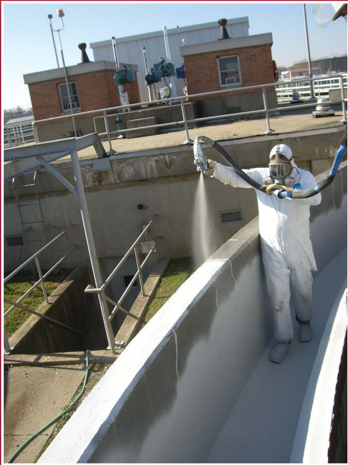
Pure Polyurea coating applied to secondary containment at a water treatment facility