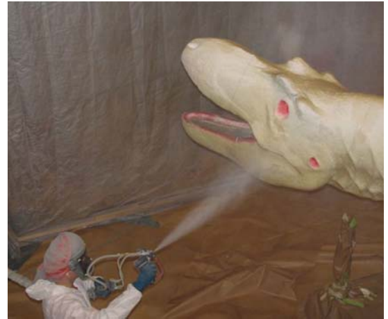
Polyurea Coating sprayed on foam and EPS