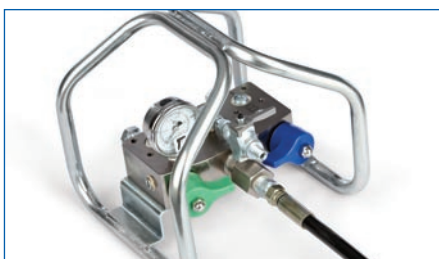
Remote Mix Manifold

Advanced sensors allow pumps to compensate for pressure fluctuations, resulting in accurate, on-ratio mixing for better yield and less waste.